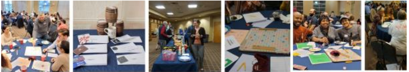
Figure 1_Scrabble Tournament Fundraiser's 2023 Sponsorship Levels

website and Social Media which has over 3,000 engaged followers across platforms and through our newsletter, which is distributed to more than 1,800 people. Member One Credit Union's logo would be included in the Player Handbook which is shared with the participants and Member One Credit Union will have their banner at our Scrabble Tournament Fundraiser. All levels of sponsorship include a team of three players to participate at the Scrabble Tournament.