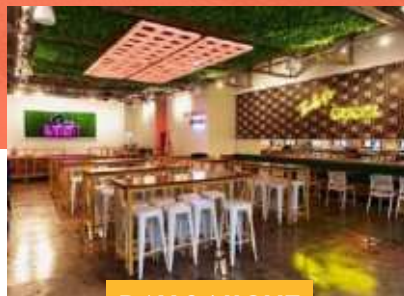
DAY & NIGHT